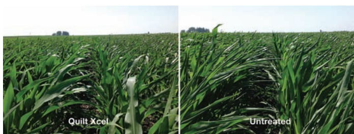
Quilt Xcel-treated corn (left) shows less leaf curling than untreated corn (right) in drought conditions. Field located in Grinnell, Iowa.

Low commodity prices have farmers evaluating products to determine if they deliver a return on investment. Quilt Xcel® fungicide provides stress management and disease control benefits that consistently help elevate yields for up to a two to three times return on investment, even at $3.25 corn.