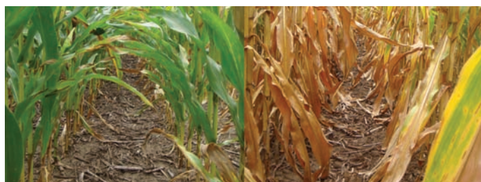
Quilt Xcel-treated corn (left) is visibly greener, healthier and stronger standing than untreated corn (right). Field located in Lacrosse, IN.