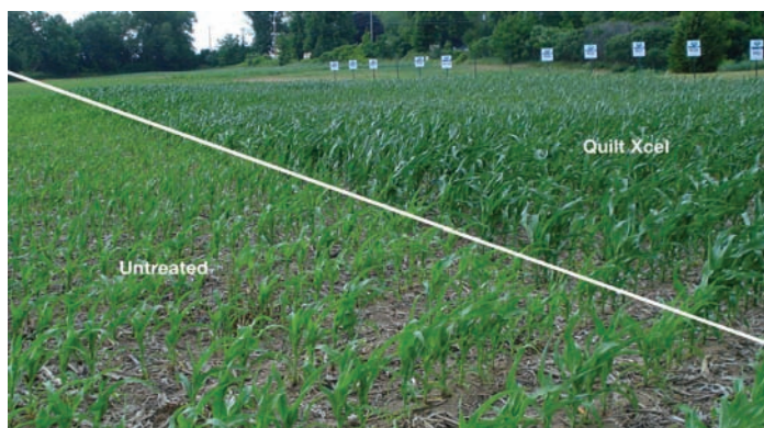
Quilt Xcel-treated corn (right) is visibly greener and experiencing more plant growth compared to untreated corn (left) across a variety of hybrid trials. Field located in Battle Creek, MI.