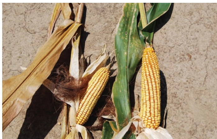
Corn treated with Quilt Xcel at V4-V8 and then again at R1 (right) is visibly greener and has larger ears than corn that did not receive treatments (left). Field located in Tunica, MS.