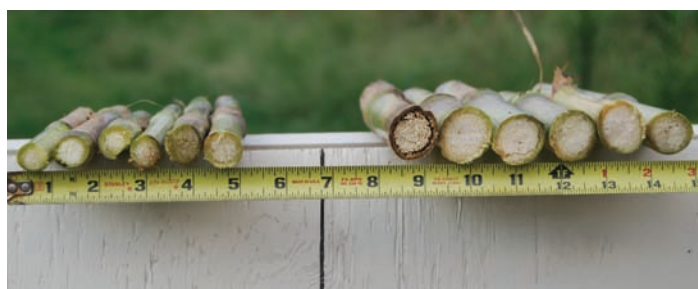
Untreated corn (left) vs. Quilt Xcel-treated corn (right) demonstrates a visible improvement in stalk quality with Quilt Xcel treatments. Field located in Trenton, KY.